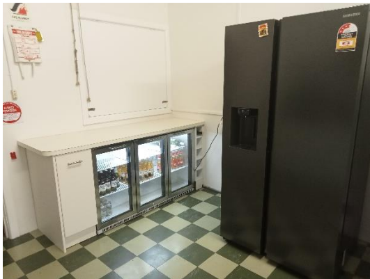
Image 2 The new fridge and bar fridge

The kitchen is used by our staff during the day and at multiple times throughout the year for special events (grand finals, trivia nights, tournaments).