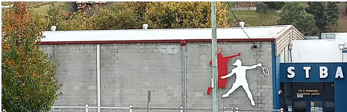
Image 1 The whirley birds installed on the roof of the hall

While there has been a noticeable decrease in condensation on the courts, the committee is aware of reports of condensation (particularly at the ends of the court) and are exploring whether additional whirley birds would help to mitigate this.