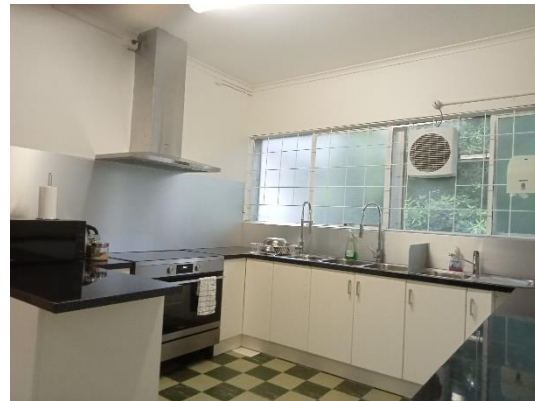
Image 3 The new oven and food preparation area